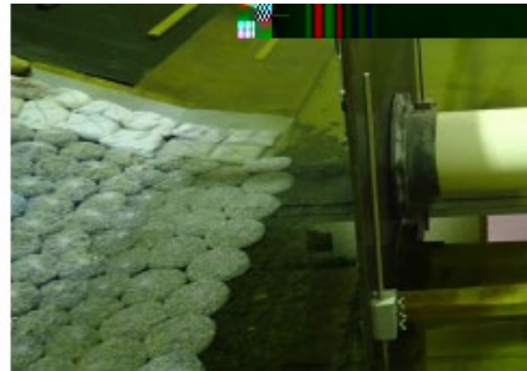
Figure 11 Rock bags on revetment slope in front of bow thruster setup

Rock bags were usually stable for the conditions tested (Figure 11). As per rocks, the jet pushed the bags up and into the slope resulting in greater stability than originally expected. The bags were susceptible to jets at angles. Also being a single layer, if a bag was moved then large sections of the slope could become unstable. The long-term integrity of the bag fabric was not assessed.