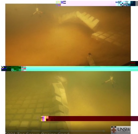
(a) Underwater video footage showing flapping of leading edge of ACMs